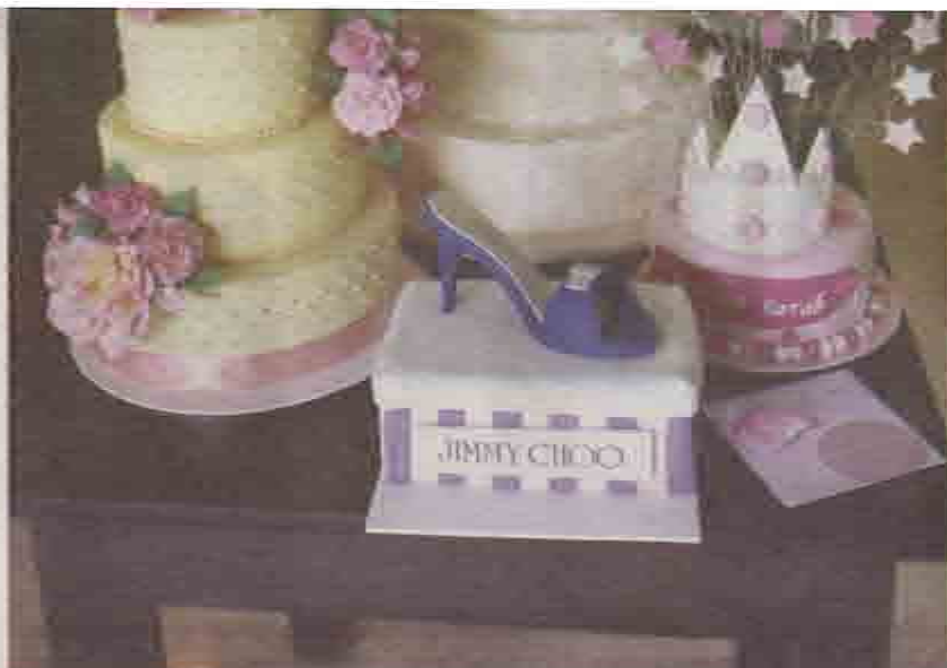
The team at Bloom can fashion any object from sugar that you choose - shoes, suitcases, iPods, you name it, they can do it. WILL BAXTER

Speaking of celebrations, Bloom has recently